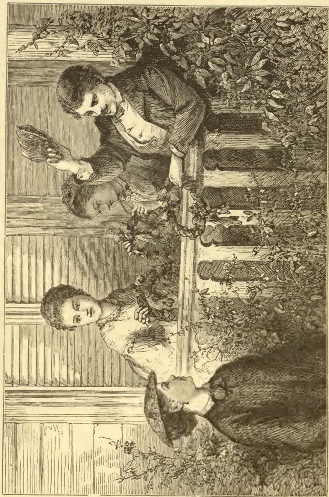
BINDING THE RINGS.